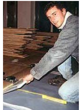
The adhesive layer is covered by tear resistant foil. The parquet is secured with straps which are only necessary if the wood moisture content on installation is greater than 9%.

for its technical reliability are provided by private and commercial properties. The system has also proved itself in multi-purpose halls in which the elastic properties of the flooring are important. Osbe customers in Holland are parquet installers but Osbe seeks contacts with parquet manufacturers in export markets.